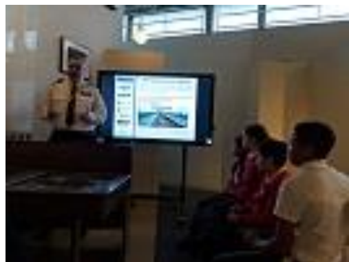
Year 6 were made aware of knife crime and the devastation to families that it can cause.